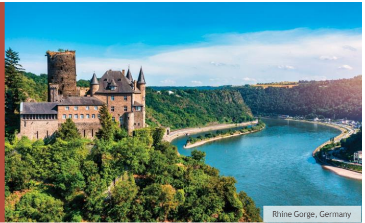
Rhine Gorge, Germany

November 7-14, 2026 | AmaStella 7-night cruise from Basel to Amsterdam