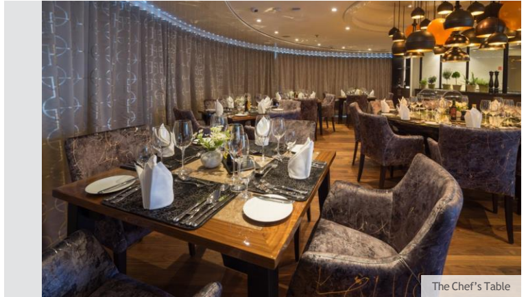
The Chef's Table